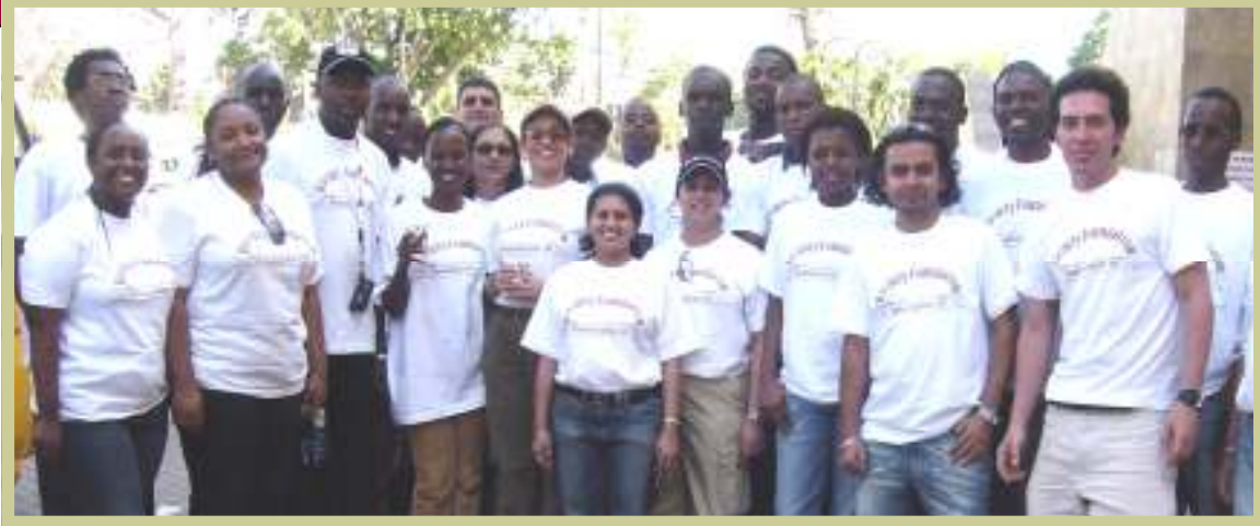
Divinity Foundation Team Kenya