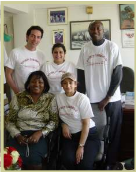
Divinity Foundation Officers Pictured with Dr Ida Odinga, wife of Kenya's Prime-minister Hon. Raila Odinga

Visit the Divinity Foundation website and read all about the personalities who are supporting the foundation today in achieving their goal of global empowerment through Hope, Humanity, Healing.